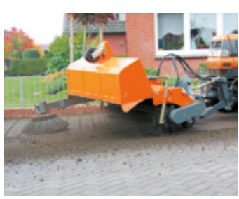
bema Sweeper equipped with bema Weed brush and rotary side brush

The combination of sweeper and weed brush makes a second work step superfluous, as the weeds can be picked up directly by the optional collection container. The additional equipment of the sweeper with a rotary side brush with weed trim sweeps up weeds growing in gutters and on curbs. The working width is between 1250 and 2300 mm depending on the model. In this way large areas are quickly and thoroughly cleared of weeds, moss and the like.