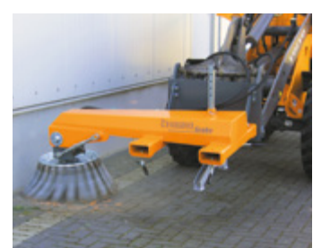
bema Groby on a wheel loader