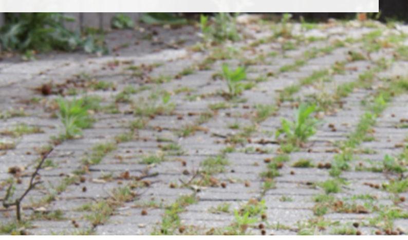
Your local bema dealer: