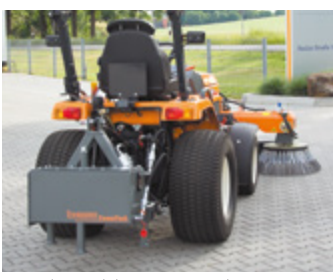
Upgrading with bema PowerPack - hydraulic power unit