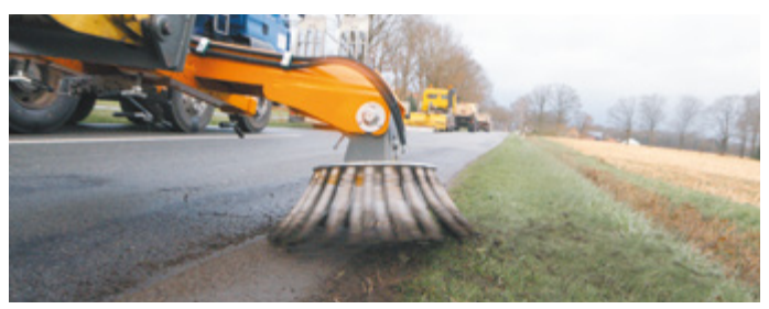
bema Groby is used for the care of road sides