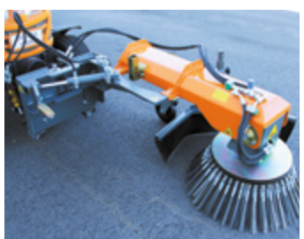
Hydraulic swivel device, approx. 85 ° to the left