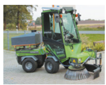
bema Groby light on a equipment carrier