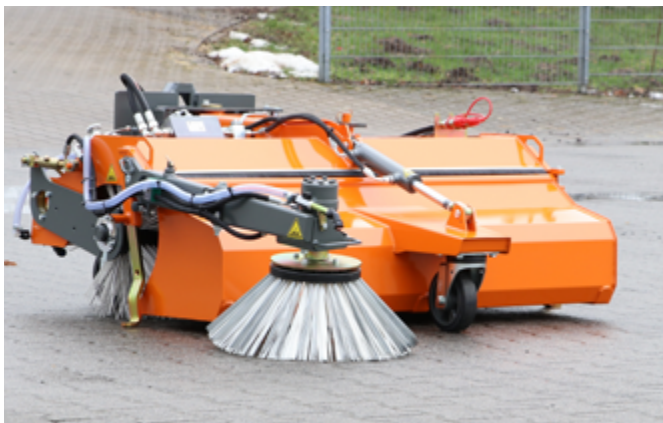
bema Kommunal 450 Dual with rotary side brush and water spray unit