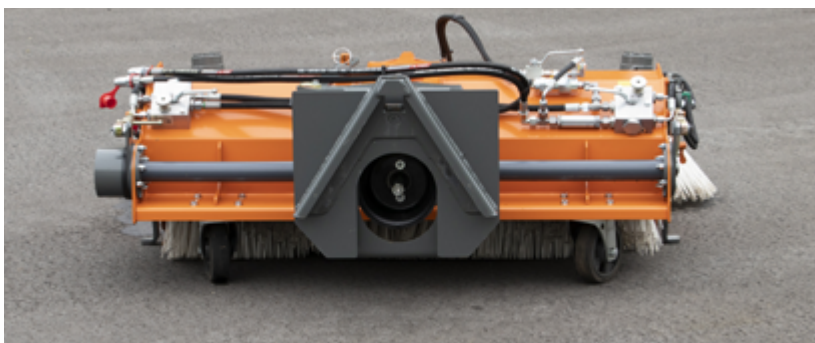
bema Kommunal 450 Dual, mechanical drive