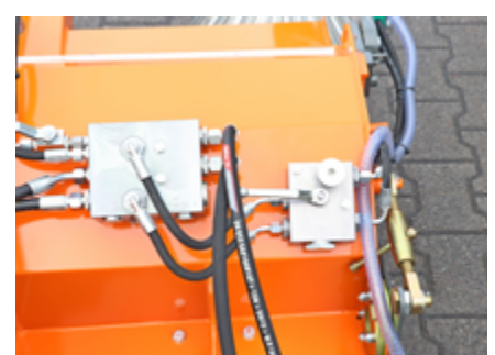
Hydroblock and bema SideControl