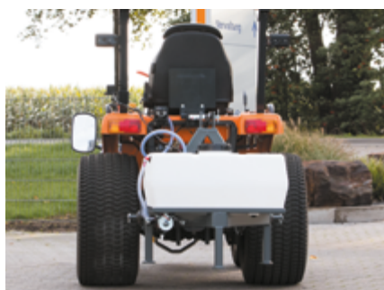
Water tank at the rear