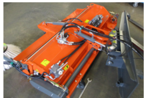
bema Kommunal 450 Dual, hydraulic swivel device