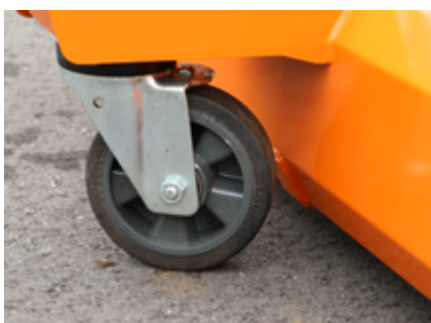
Heavy-load wheels Ø 160 x 50 mm