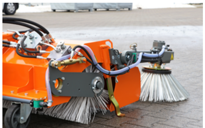
Rotary side brush with water spray unit