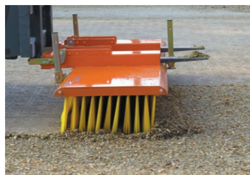
The push broom convinces with 11 rows of bristles