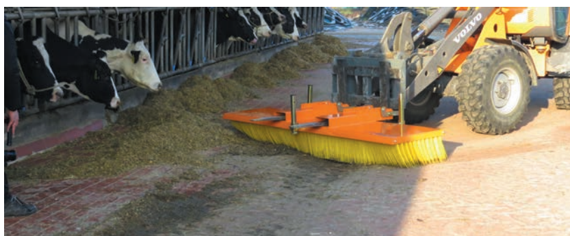
Sweeping animal feed is no problem with the bema 11 Multi-Clean