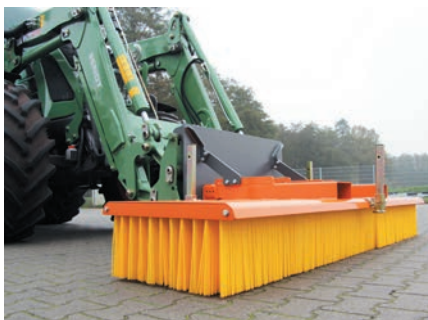
Quick change adapter for front loaders (Euronorm)