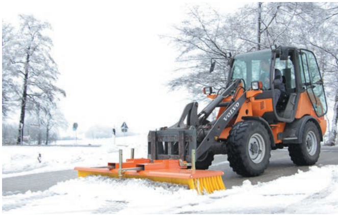
Use in winter service: bema 11 Multi-Clean on a wheel loader