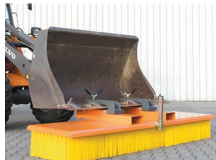
Shovel mounting incl. clamping screws