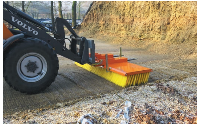
Pushing silage with the bema 11 Multi-Clean