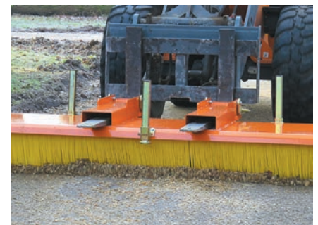
Pallet mounting with a tool-free locking