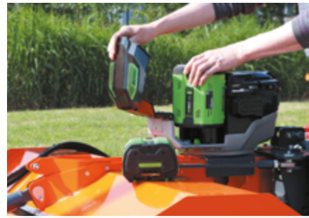
EGO Power electric motor with two powerful 56V ARC Lithium™ batteries