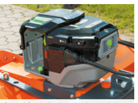
Optional: Supply directly via the electric vehicle via integrated 48V DC socket