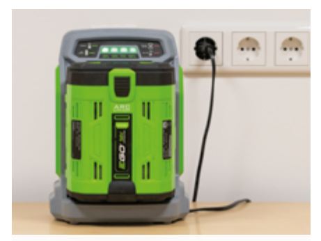
Optional: Battery charger