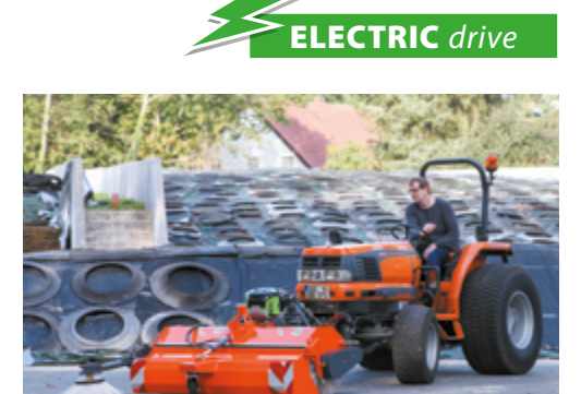
bema Sweezy® 580 Dual E attached to a compact tractor