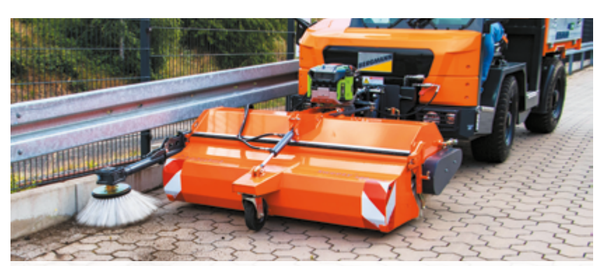
bema Sweezy® 580 Dual E with mechanically driven rotary side brush attached to an e-dumper